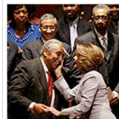
Congressional Black Caucus Assesses Its Role