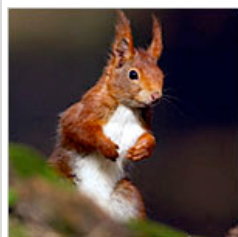
Saving a Squirrel by Eating One