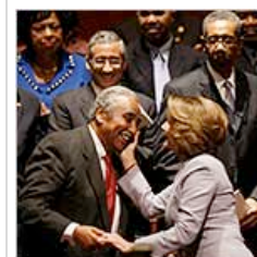
Congressional Black Caucus Assesses Its Role