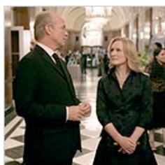
Suspenseful Corporate Litigation Returns