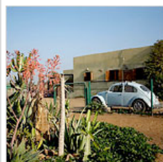
In Egypt, Living on a Farm