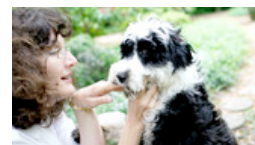
First Pup Unleashes Demand for Water Dogs