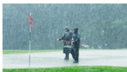
The U.S. Open's Giant Water Hazard