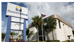
Ex-Bank CEOs Become Buyout Pitchmen