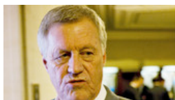
In House, It's Peterson vs. Climate Bill