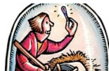
Finding Gems Among Market Laggards