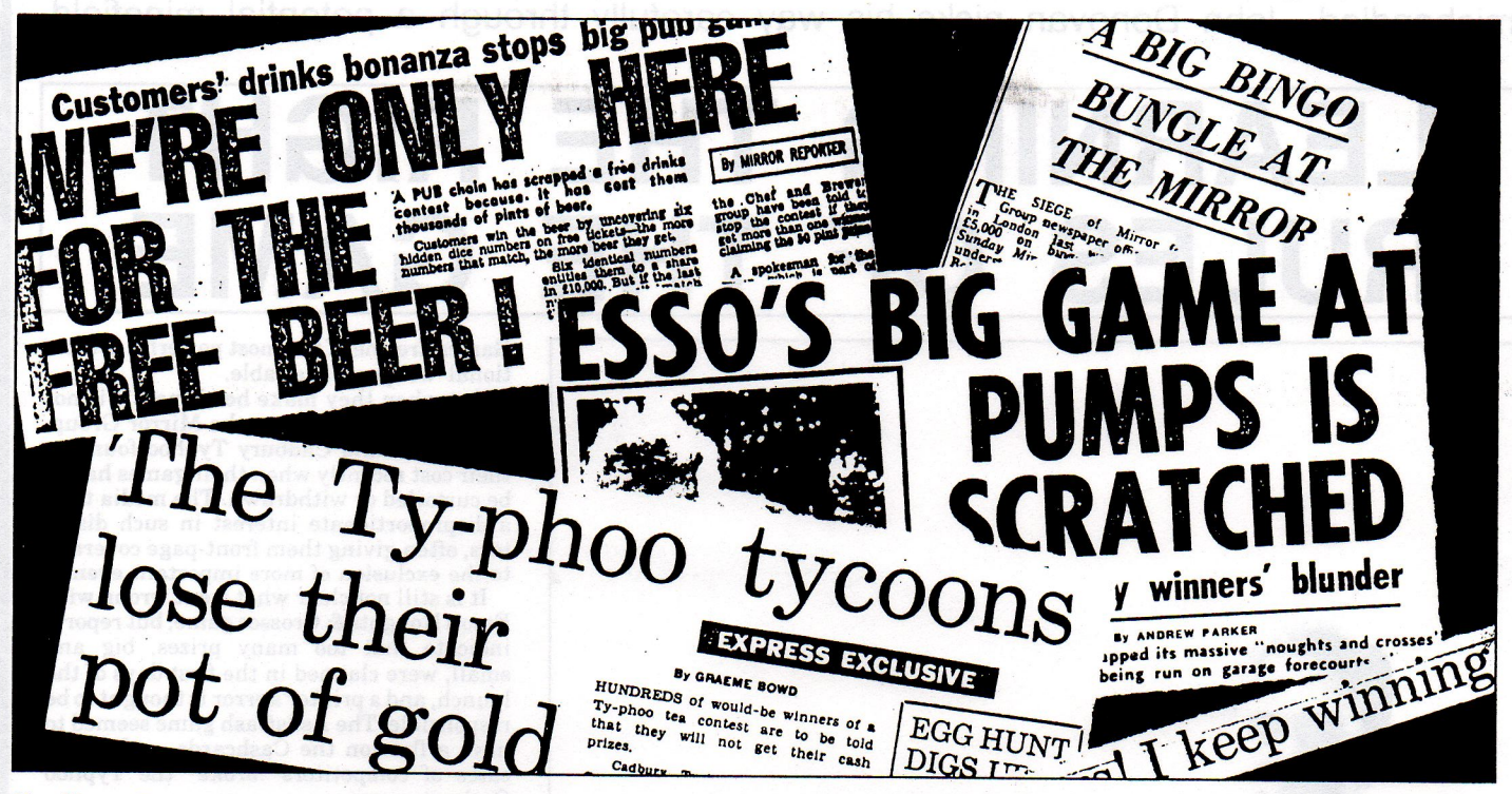
Headlines: The media are not slow to pounce when a promotional game turns into an embarrassing disaster

→ that is, the identification of winners at any stage before distribution to consumers. See-through can also enable people to get skill and probability games right every time