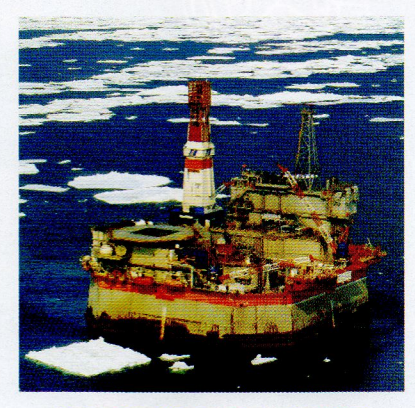
Part of the Sakhalin island project

In the mid-1990s, when Shell signed the contract, the oil price was low and Russia was on its knees financially. Moscow needed the expertise Shell offered. But by the time Shell was announcing a doubling of costs on Sakhalin, President Putin was rather less respectful of foreign energy companies. The cost increase—which post-