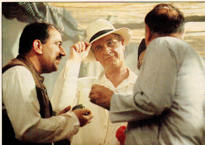
Del Monte: Top redundancies mean brand managers now report to md

The company recently reformulated its long-life juice brand and this week