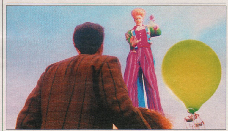
Fuji breaks a national television commercial in support of its new film -Fuji Colour Super G Plus - through Saatchi & Saatchi this week. The ad features a surreal fairground setting and questions perceptions of reality: "You see fairground attractions, which you assume are real, but then realise you're looking at a photograph," a spokeswoman said. The UK launch is worth more than £2m and will run through the summer.

"We're trying to get people to reconsider purchasing a more premium brand rather than a black box - because there are lots of black boxes out there but we have that fusion of form and function," Spence said.