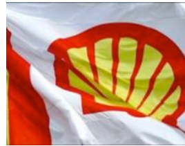
Flagged up: Shell suffered more workforce deaths last year than its peers