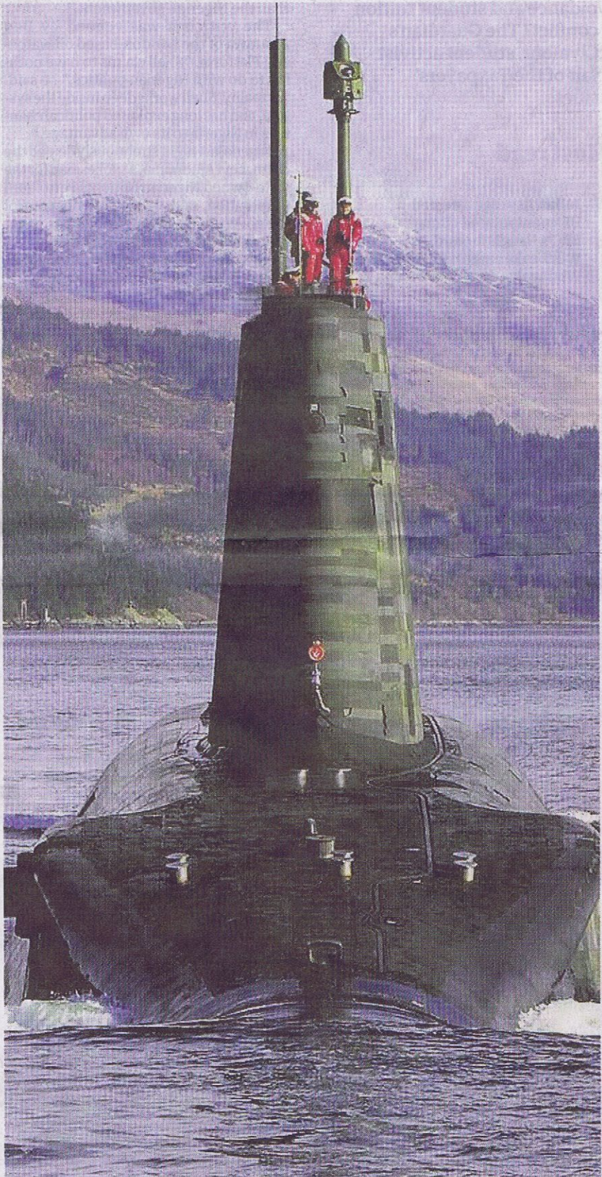
HMS Vengeance, one of four Vanguard class boats with Trident nuclear missiles. The US feared it might not be renewed

Two senior Whitehall officials as diplomats that the renewal of Trident nuclear deterrent would, apparently contradicting then prime minister Gordon Brown's public statement proposing some disarmament according to leaked US embassy